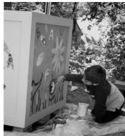
A student works on TNS's entry in the city's "Flower Power" planter program.